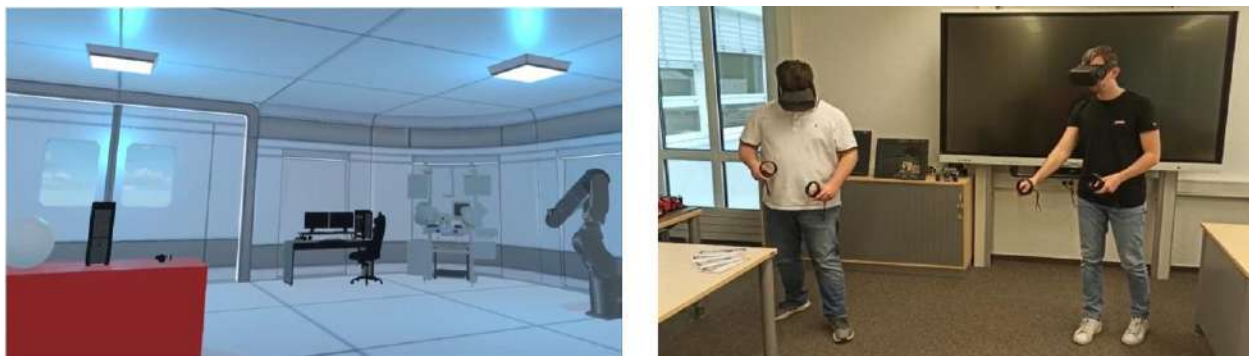
Figure 3: Collaborative Training Situation in Virtual Reality: Operating and Disassembling Machines in A Fully Immersive Way

Real-time collaboration is an important feature of the smart education of the future. For example, a multiplayer learning experience can promote team-based learning activities and foster curriculums based on group tasks. This kind of learning unit improves communication, teamwork skills, and the ability to coordinate in work with many different personalities having different capabilities, weaknesses, and strengths. Figure 3 shows a collaborative training situation in a fully virtual automation laboratory. The trainees learn how to operate and disassemble machines. They are immersed in that virtual world using VR-Headset.