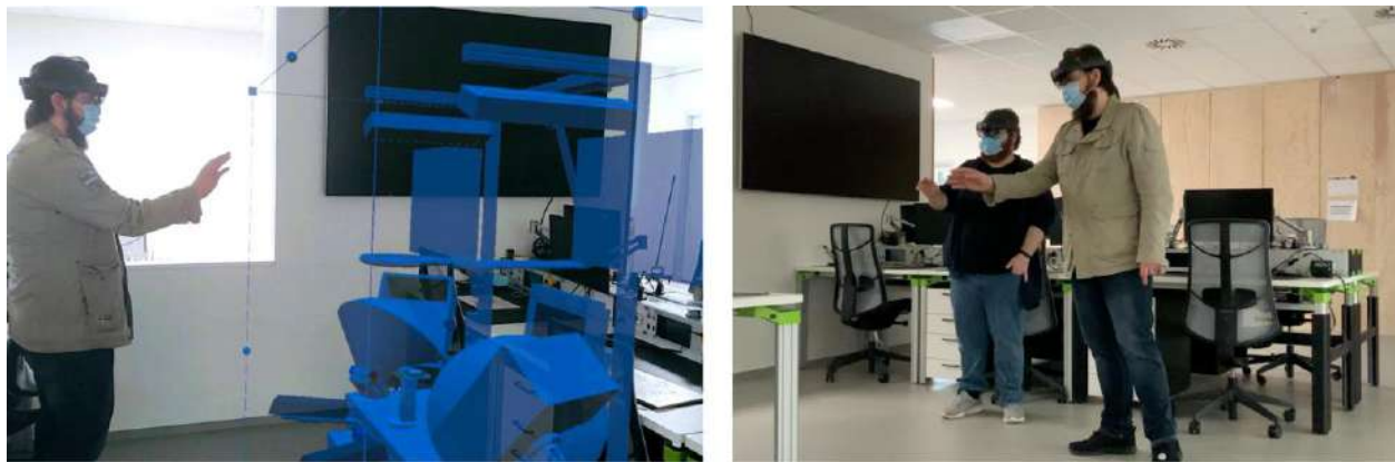
Figure 4: Collaborative Training Situation in Mixed-Reality, Where Holograms of Machines Appear as A Natural Part of The Real World

The trainee in figure 4 using MR-Headset can see their real environment and interact with each other while working with a hologram of a machine. They learn together, review the construction of a machine (full-size) in the classroom and make the needed changes in real-time. They can freely move around the machine, open and disassemble it. The linking of the real environment with virtual content increases the learning effect and the fun factor during the training experience.