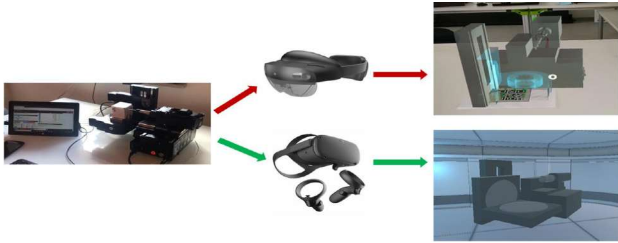
Figure 2: Training on The Same Content (Milling Machine) Using Different Technologies (VR and MR) Because Of Different Types of Learners

Quest). Both technologies provide a powerful learning framework, that allows learners to deepen and solidify their knowledge through practical exercise.